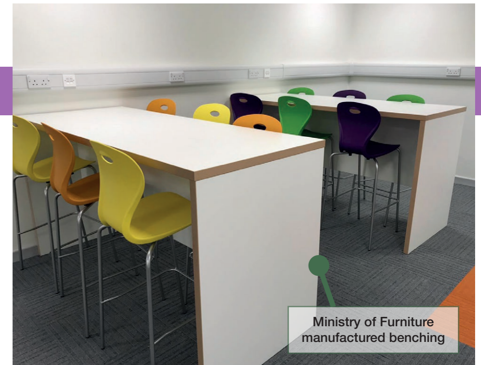
Ministry of Furniture manufactured benching