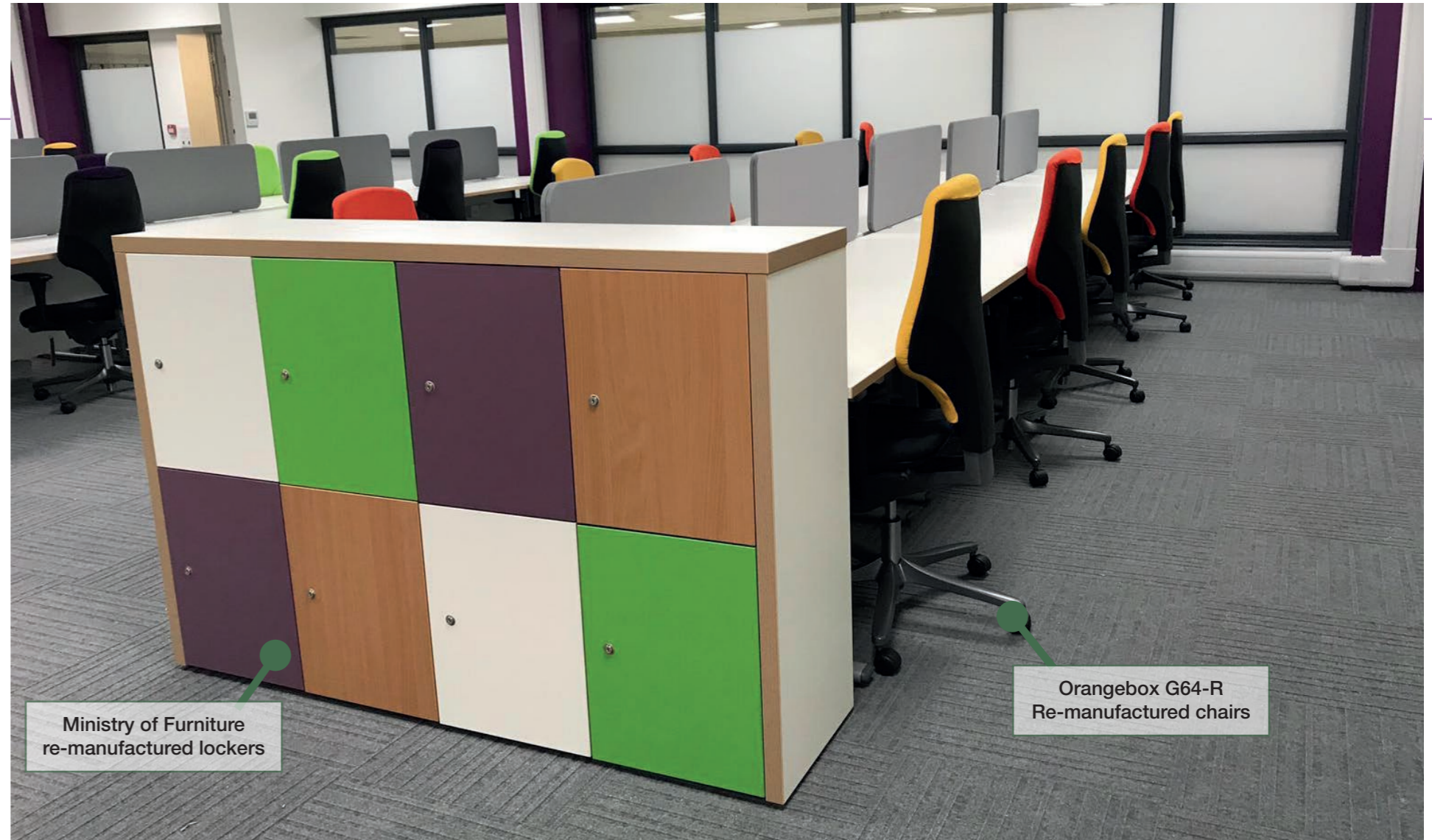
Ministry of Furniture re-manufactured lockers