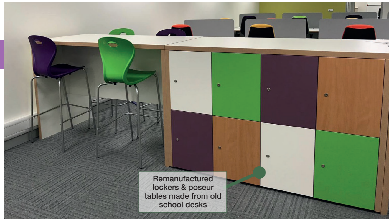
Remanufactured lockers & poseur tables made from old school desks